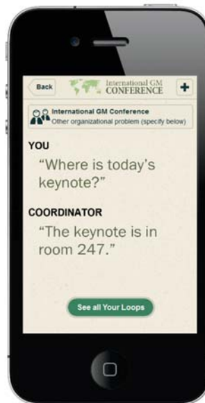
BlazeLoop® Conference Engagement